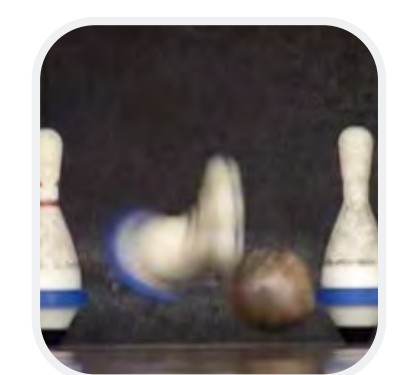
Bonnie Doon Bowling Lanes