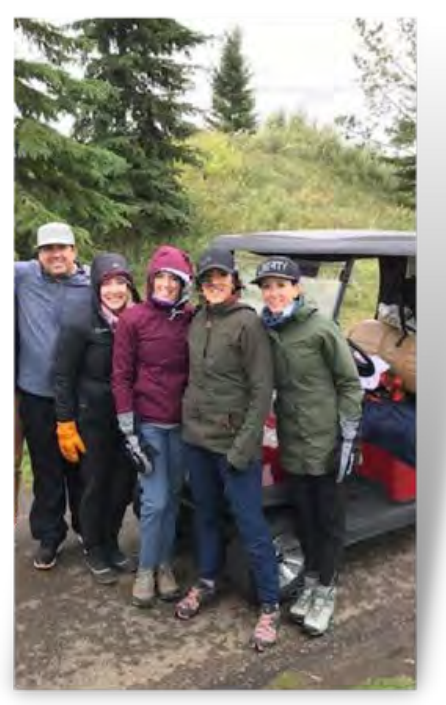
Pictured: The Baldry Family Liberty Classic Charity Golf Tournament