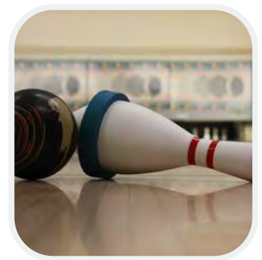
Bonnie Doon Bowling Lanes