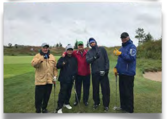
Thumbs up with this foursome at the Liberty Classic