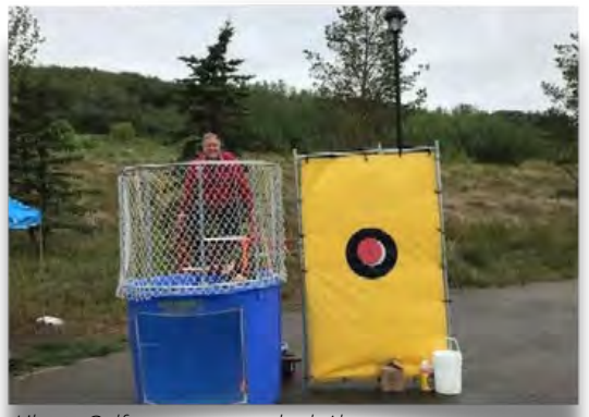
Liberty Golfers attempt to dunk Alar